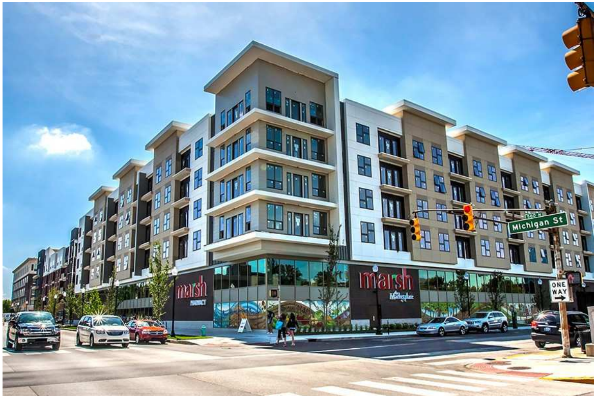
Project of the Year Award Winner Axis at Block 400 in Indianapolis.

The ICACI held its Annual Meeting & Awards Banquet on April 22 at the Marriott North in Indianapolis to packed house of nearly 100 attendees. Fourteen projects received awards, including Project of the Year Winner Axis at Block 400 luxury apartments in Indianapolis.