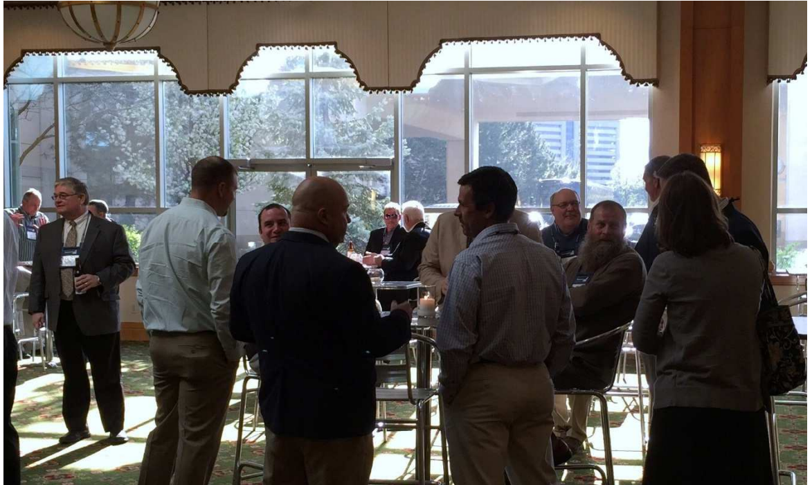
Social hour before the Banquet was arguably enhanced by free beverage tickets.